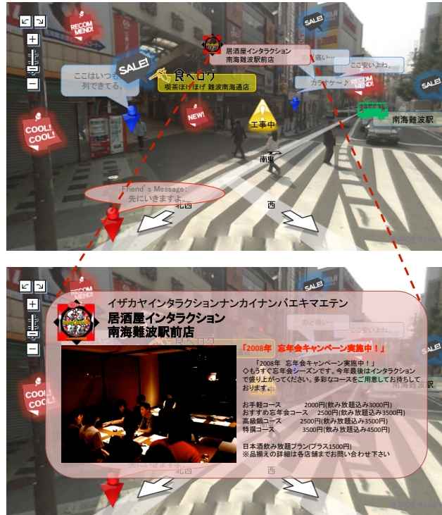
Fig. 1. Client System Overview

client system with the linked device to augment various functionalities. Among the possible scenarios, a CollabLink may be connected to the public big display device that also appears in the Street View image. In this case, after clicking the CollabLink icon, the big display device can be used for displaying or replaying any view and contents in the client system. Such display can be used to leave a public BBS in collaboration with other users for exchanging information around that spot.